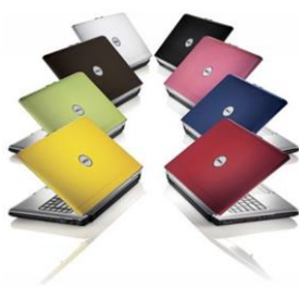
A Computer Enhanced curriculum allows for a more personalized education.

Not only does our curriculum make education more interactive than traditional text books, it also allows the instructor to customize the materials to each student's specific needs. Our instructors have the ability to edit and adapt according to each child's strengths and weaknesses giving them a truly personal education. Your child may advance more quickly in subjects that are his strengths or be directed to supplemental exercises to strengthen him where he may be struggling.