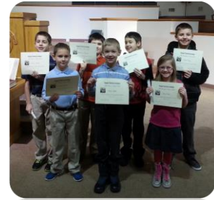
Our Annual Awards Ceremony recognizes student achievement.

Parent/Teacher conferences are scheduled with each family to insure proper communication and awareness. However, teachers are available after school to answer any general questions and special conferences can be set up at any time to discuss your child's personal needs.